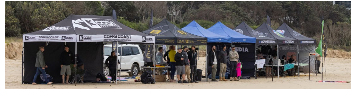
2022 DKS Lighthouse Beach event setup.