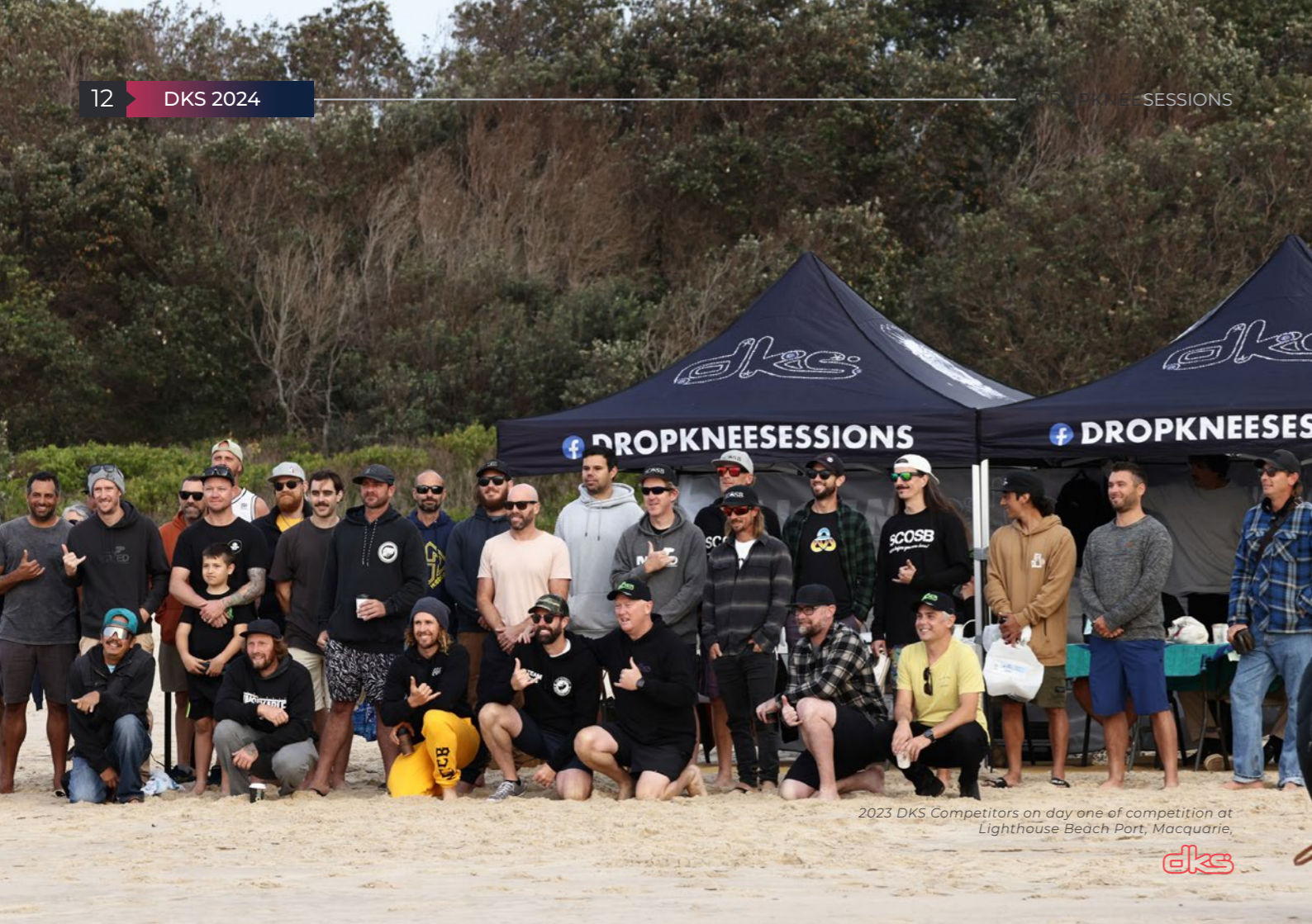
2023 DKS Competitors on day one of competition at Lighthouse Beach Port, Macquarie,